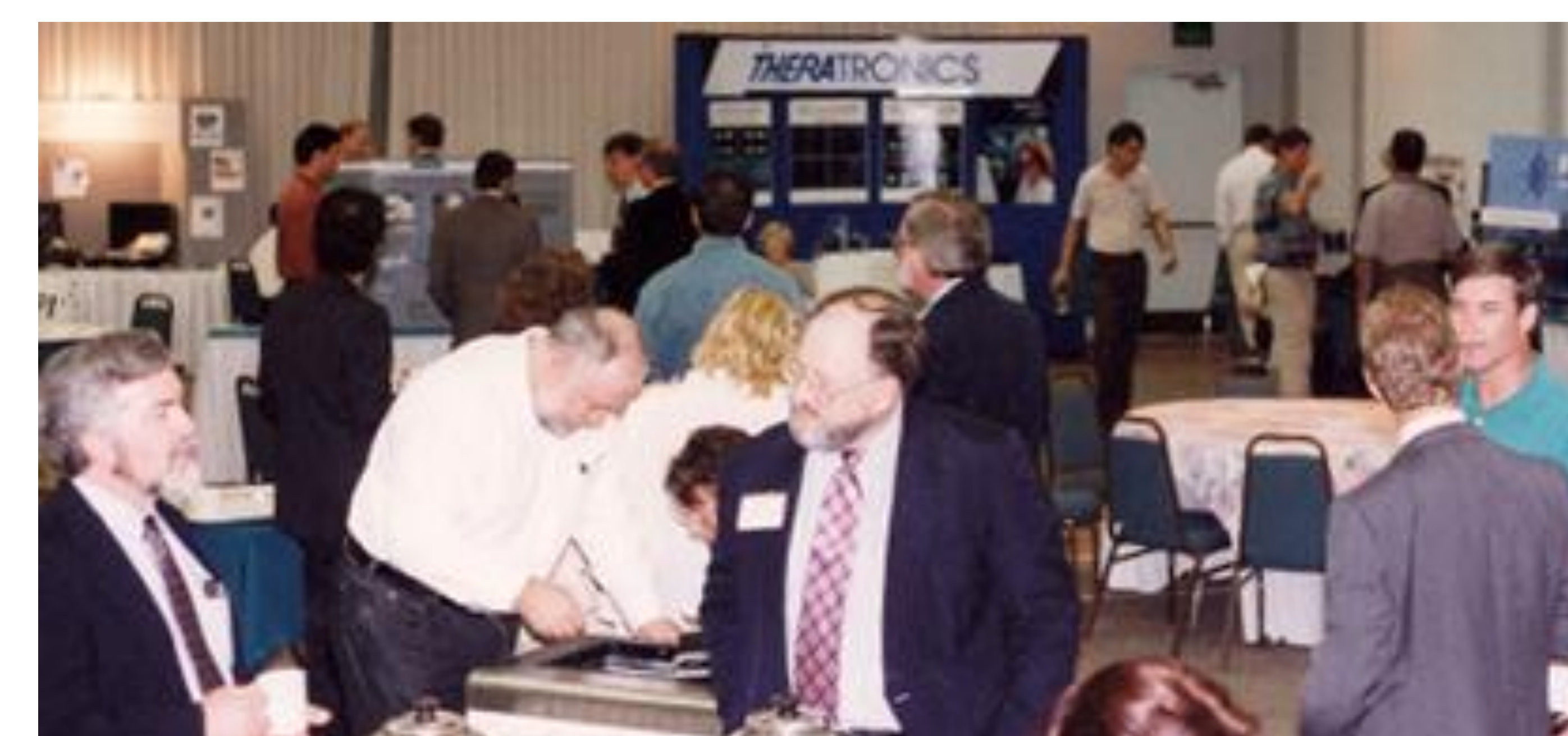
FLAAPM has traditionally enjoyed strong vendor support at chapter meetings.

The Florida chapter has grown immensely in numbers and activity from its early self. The 1.5 day Spring chapter meeting is the main meeting event of the year, generally drawing well over 100 attendees and more than forty vendors. Each Fall, a one day meeting is held jointly with the Florida HPS. In total, the chapter offers twenty license CE credits each year, including the all-important and otherwise elusive Medical Errors and HIV/AIDS credits. ABR MOC participants receive CAMPEP and SAM credits from chapter meetings. The chapter website includes SAM presentations and credits for chapter members and for a large number of out-of-state MOC participants.